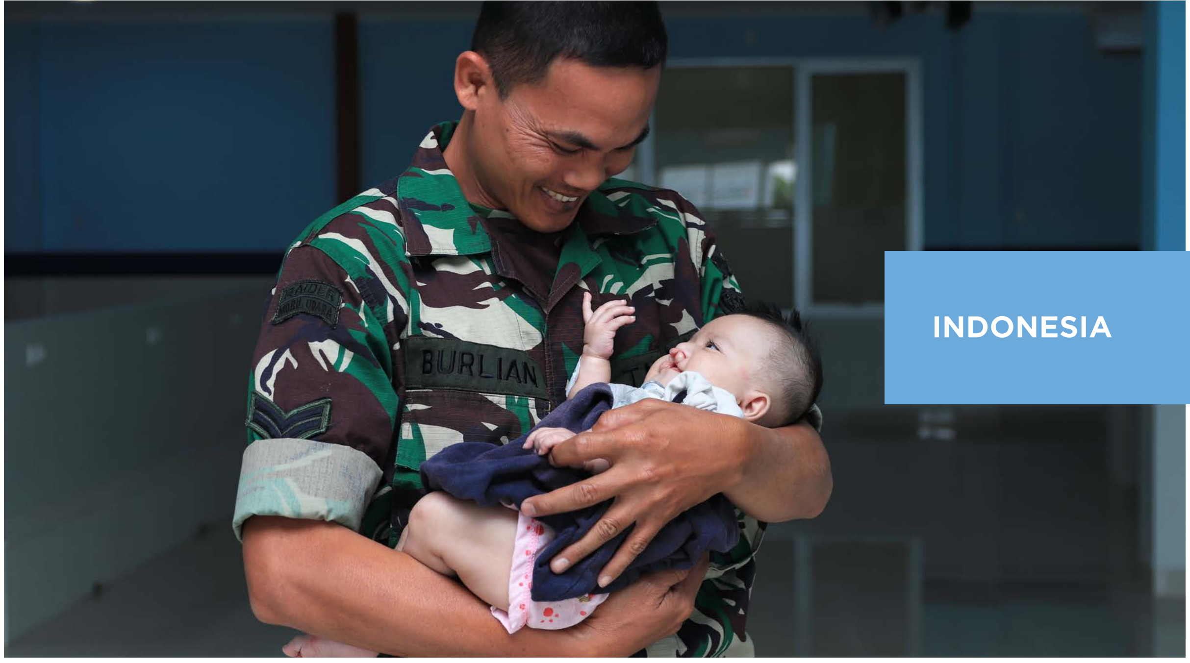
Soldier with baby, Indonesia